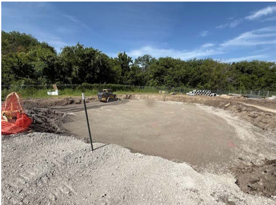
Maintenance building foundation under construction