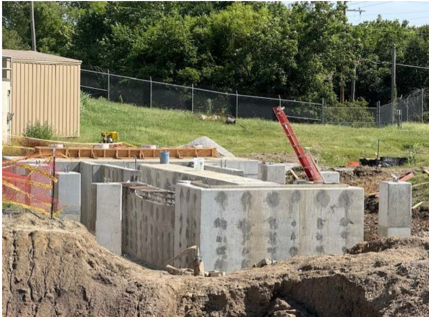
Ultraviolet Structure under construction