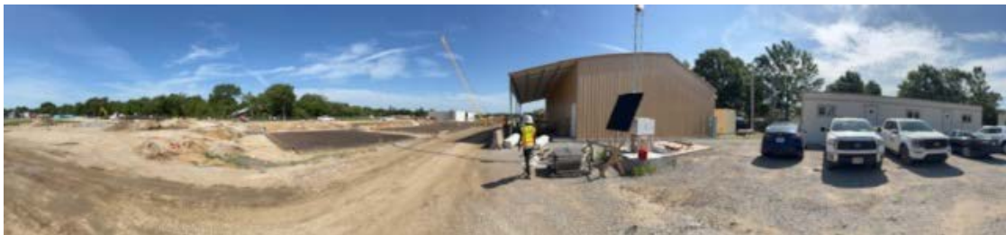
Panoramic View of the WWTF Project