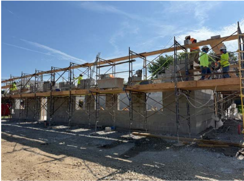
Administrative Building in progress