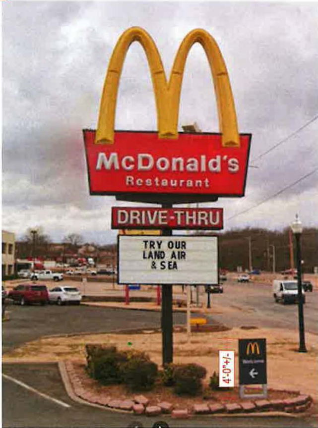
EXISTING 4' TALL DIRECTIONAL