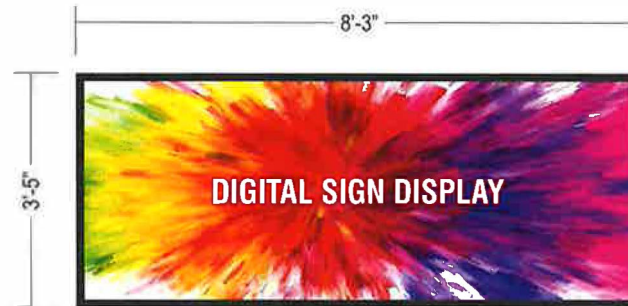
ELECTRONIC MESSAGE SIGN DETAIL SCALE: 3/8" = 1'-0"

PERSONA TRIANGLE FACILITY SERVICES | LIGHTING | SIGNAGE